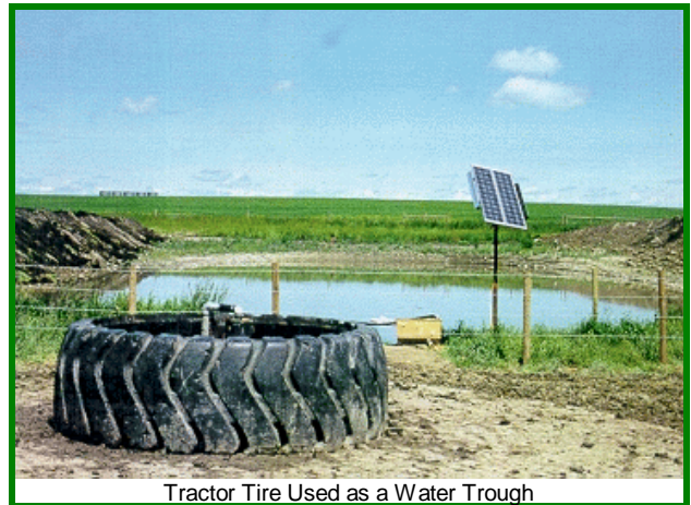
Tractor Tire Used as a Water Trough