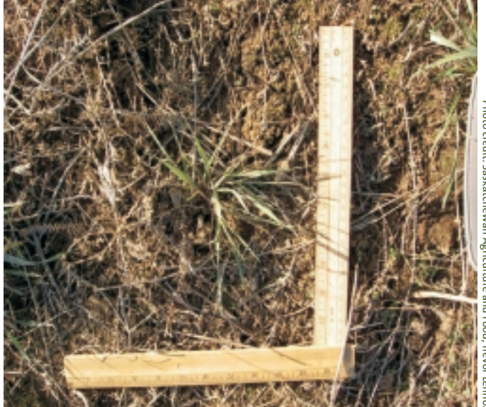
Poor stand <1 plants/ft<sup>2</sup>