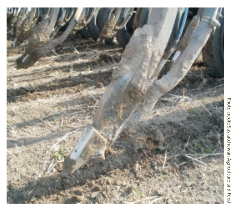
Air seeder opener

seeding operation. Air seeders/drills are large capacity machines that can seed large acreages quickly, have excellent trash clearance and, depending on the opener used, have very good seeding depth control and packing capability. Air seeders generally have packers mounted at the rear of the cultivator frame whereas air drills have packer wheels mounted on the cultivator shank. Air drills provide superior depth control and on-row packing. When using seeders with an air delivery system, fan speeds should be kept low to avoid blowing the seed out of the furrow.