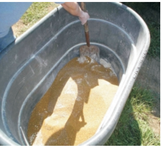
Applying self sticking powdered inoculant