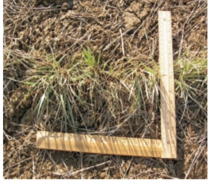
Satisfactory stand 4 plants/ft<sup>2</sup>

Saskatchewan Watershed Authority 1.306.787.8707 www.swa.ca