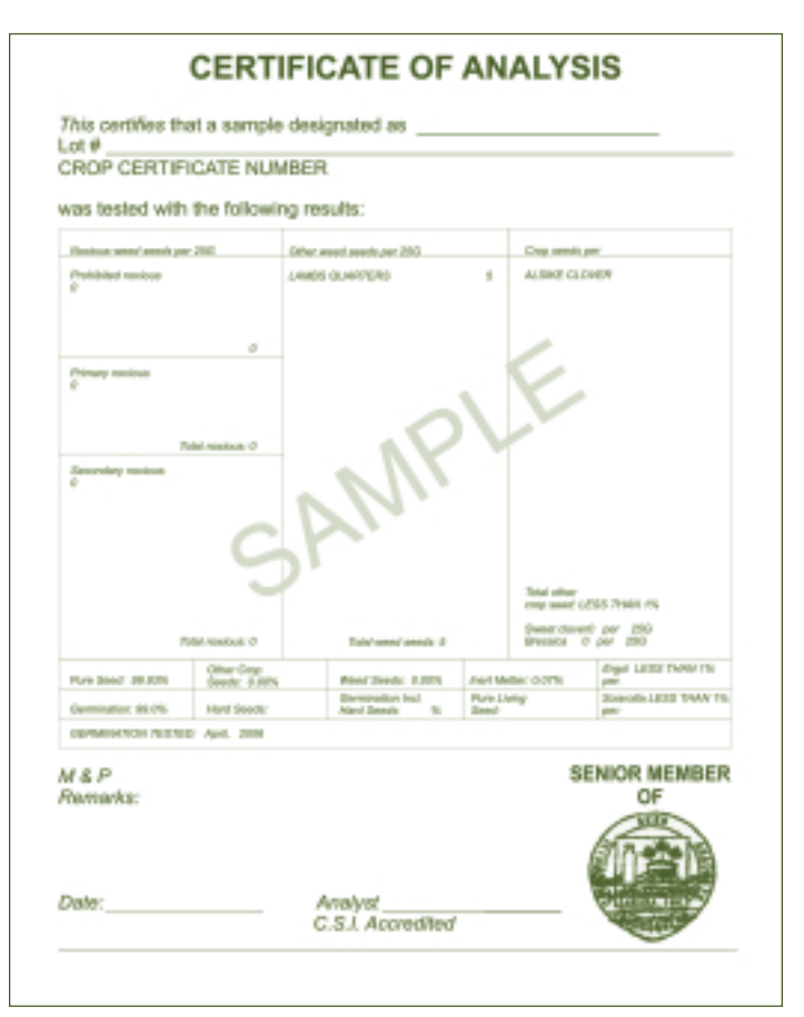
Certificate of Analysis

Most forage stands are in production for several years. Purchasing quality seed represents a sound investment and provides benefits throughout the life of the stand. The use of certified seed will allow for the selection of a cultivar with appropriate hardiness and disease resistance, as well as documented germination and purity. Using seed of a top yielding variety will increase the