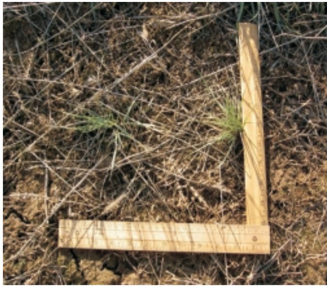
Fair stand 2 plants/ft<sup>2</sup>