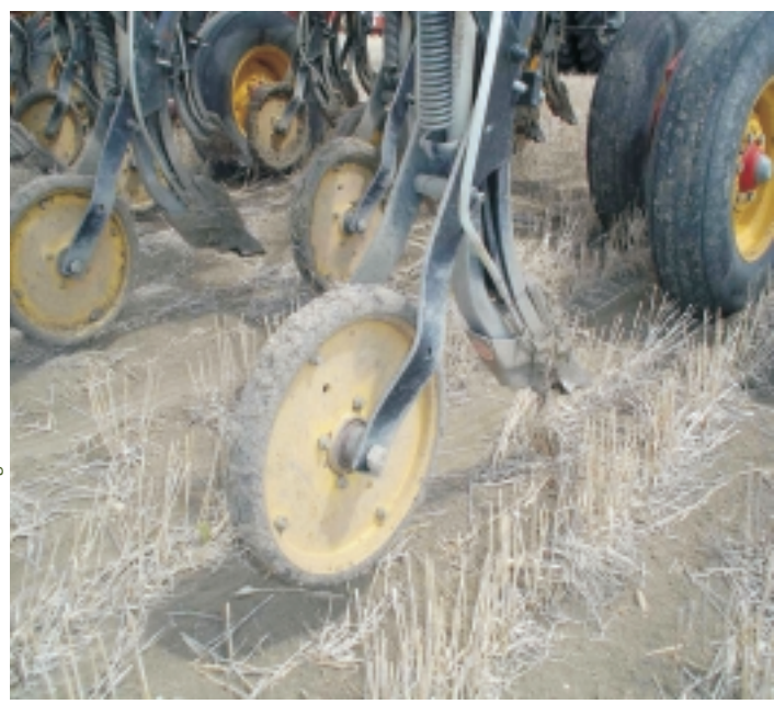
Air drill opener with shank-mounted packer wheel

Air seeders/drills use a central tank, a pneumatic delivery system and openers mounted on a cultivator frame to complete the