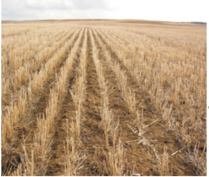
Clean stubble field suitable for seeding forages

Negative effects of cover crops can be mitigated by seeding cover crops at reduced rates (1/3 to 1/2 grain production seeding rate), harvesting the cover crop early for feed, keeping stubble heights high when harvesting and avoiding competitive cover crops, such as barley. Cover crops can be cross-seeded to the forage to reduce competition. When seeding the cover crop with a forage in one pass, seed at a depth appropriate for the forage. Do not seed a cover crop when seeding forage species that are difficult to establish (such as the wildryes and native species), if moisture is limiting, or in the Brown soil zone.